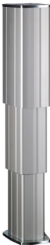
The Thomson LC 2000 lifting columns are self-supporting and height adjustable lifting solutions in a compact, pre-aligned package, perfect for applications requiring telescopic motion.

Lifting column solution boosts production ergonomics