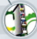
PROGRAMMABLE LOGIC CONTROL (PLC)