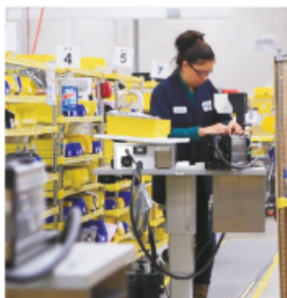
The LC 2000 provided an easy to install, low-cost ergonomic solution that increased operator comfort and productivity in the Videojet production line

In manufacturing, VideoJet had recently moved from typical stationary workstations to using mobile cart workstations. However, Videojet operators expressed concern over the difficulties of working with the carts, primarily because they had difficulty either reaching up to or bending down to the printers in the carts. Engineers first considered purchasing a cart and looked at a number of off-the-shelf alternatives. Most readily available carts offered only a manual, mechanical height adjustment requiring extra time to adjust. This would also create difficulties for smaller operators when heavier products were on the cart. A few offered an electrical height adjustment but they were expensive and the amount of adjustment did not fully accommodate the differences in height among the operators. None of the carts offered for sale could accommodate the assemblies that travel with the printers.