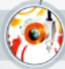
SENSORS & FIELD TRANSMITTERS