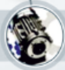
INDUSTRIAL MOTOR DRIVE