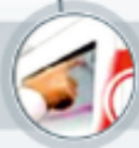
HUMAN MACHINE INTERFACE (HMI)